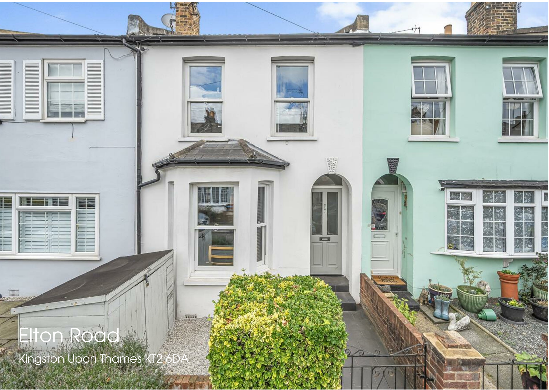
Elton Road Kingston upon Thames KT2 6DA